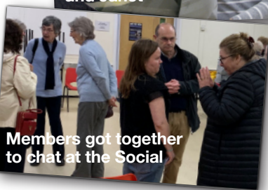
Members got together to chat at the Social