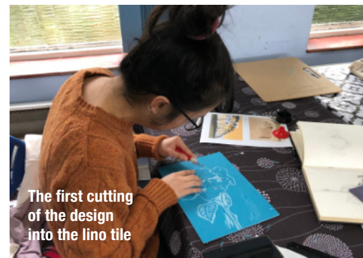
The first cutting of the design into the lino tile

Eleanor started the day by showing her wonderful different lino cuts so that participants could choose between a single cut using only one or two colours and a reduction print. The reduction print needed different stages of cutting as the design is produced from one single lino block, layering up the colour each time the lino block is cut so by the end of the day there will be a multi-coloured print.