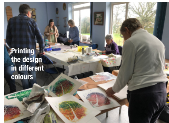
Printing the design in different colours